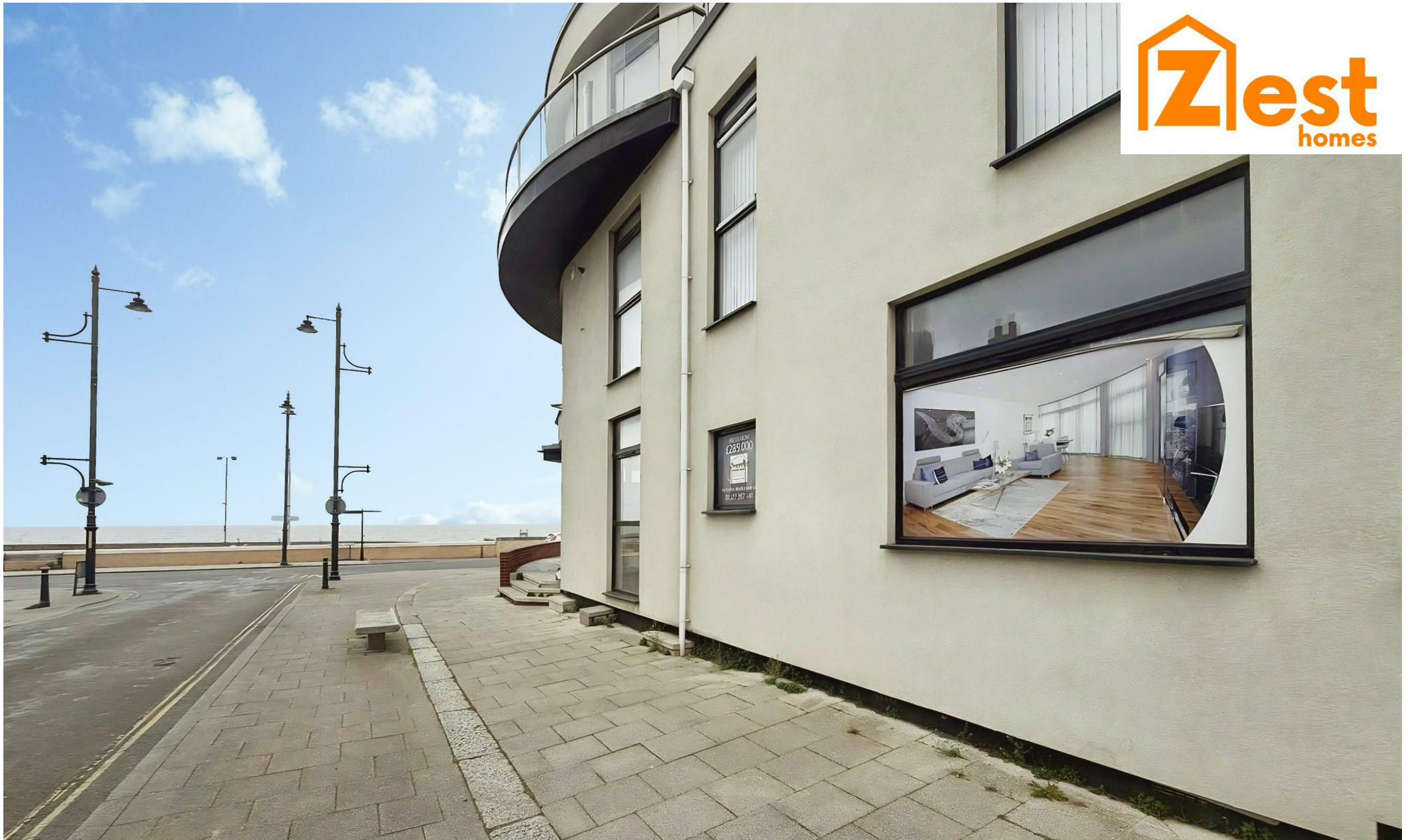
Commercial Unit, Bun Penny William Street, Herne Bay, CT6 5EW £1,250 Per month